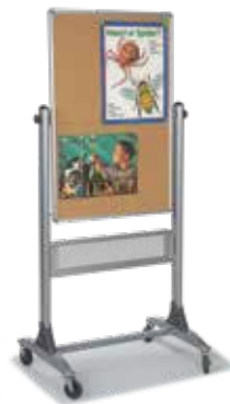
MOBILE PLATINUM REVERSIBLE BOARD